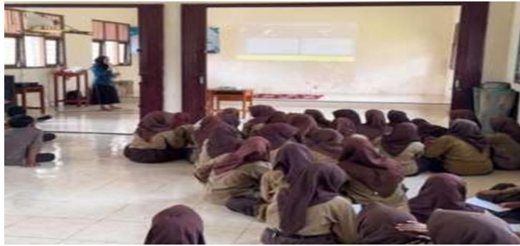
Figure 2. Material presentation about sexual abuse.

After presentation, the activity continued with discussion and Q&A session. During the discussion, participants were active in asking many questions and showing interest in the issue of sexual abuse. Many participants asked about how to handle perpetrators of sexual abuse and how to prevent the occurrence of sexual abuse, as well as sharing their own experiences with sexual abuse cases. To encourage participants' enthusiasm, the community services team provided door prizes for participants who were active during the presentation and discussion sessions.