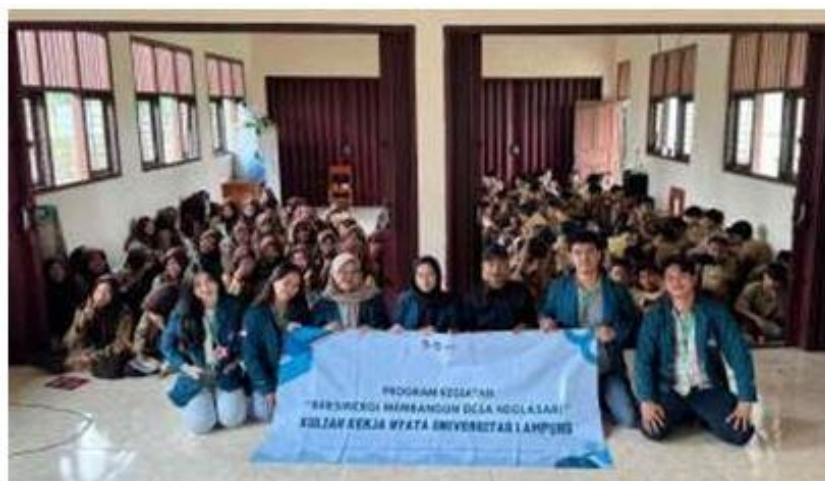
Figure 5. Photo session with socialization participants.

As seen in the post-test results in Figure 4, it is evident that participants successfully increased their level of understanding, ranging from 65 to 80% for all questions given. This indicates that their knowledge and understanding about legal protection and the impacts of sexual abuse on women increased after attending the material presentation and participating in the discussion.