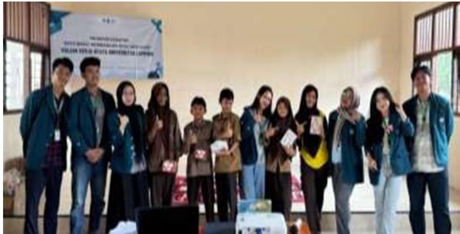
Figure 3. Door prizes for active participants during the socialization activity.

After presentation, the activity continued with discussion and Q&A session. During the discussion, participants were active in asking many questions and showing interest in the issue of sexual abuse. Many participants asked about how to handle perpetrators of sexual abuse and how to prevent the occurrence of sexual abuse, as well as sharing their own experiences with sexual abuse cases. To encourage participants' enthusiasm, the community services team provided door prizes for participants who were active during the presentation and discussion sessions.